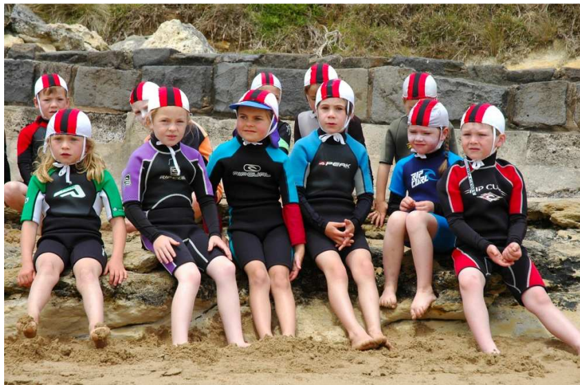
Our future Life Savers

And the most important position holders of all whom are not listed You, the members!!