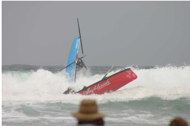
Not quite going to plan